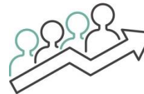
Human Resource & Skill development